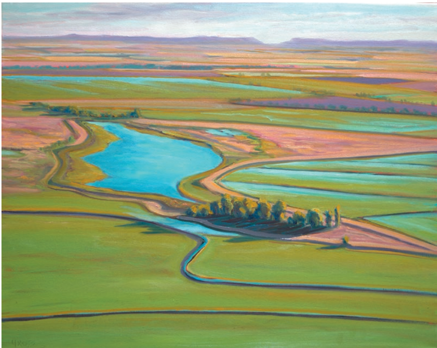
Yolo Landing Zone

The Yolo Basin Foundation is a non-profit public benefit corporation dedicated to the appreciation and stewardship of wetlands and wildlife through education and innovative partnerships.