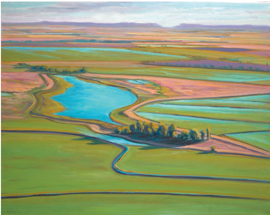
Yolo Landing Zone

The Yolo Basin Foundation is a non-profit public benefit corporation dedicated to the appreciation and stewardship of wetlands and wildlife through education and innovative partnerships.