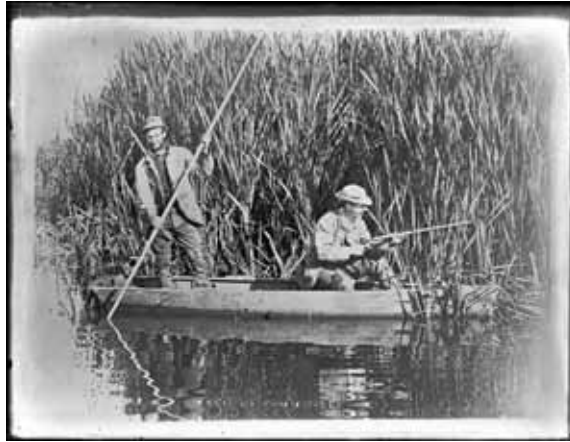
Hunters in a tule splitter, circa 1900.

Every winter we cherish the sight of thousands of geese swirling overhead in the Yolo Bypass Wildlife Area. Photographers spend hours seeking the ultimate waterfowl picture, many of which we love to see at Bucks for Ducks. But not long ago, even into the 1950's, those sights were seen by many as principally an opportunity for profit. From the Gold Rush through the Great Depression, market hunters shot upwards of a quarter-million ducks, geese and shorebirds each year in order to meet the demand of restaurants and saloons from San Francisco to Lake Tahoe.