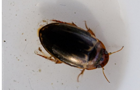
10 Predaceous Diving Beetle, Disintegrated Diving Beetle, Agabus disintegrates (Insect)