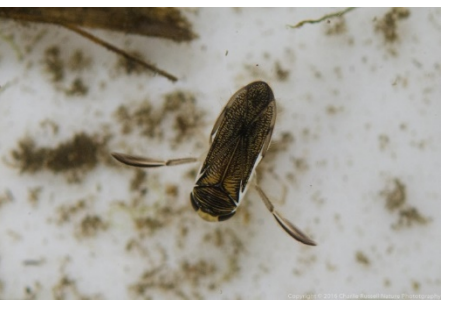
13 Water Boatman, Family Corixidae (Insect)