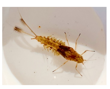
9 Mayfly nymph (Insect)