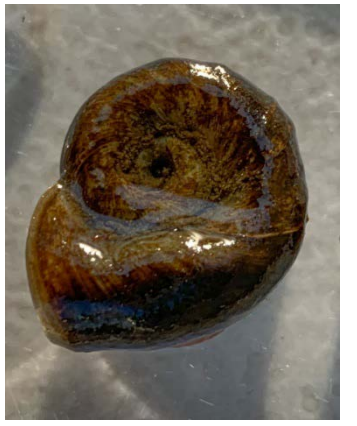
21 Marsh Ramshorn pond snail -Planorbella trivolvis (Mollusc)