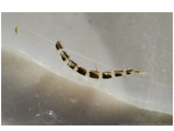
19 Midge larva exuvia (cast off skin) (Insect)