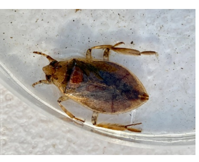
14 Giant Water Bug, "Toebiter", Belostoma sp (Insect)