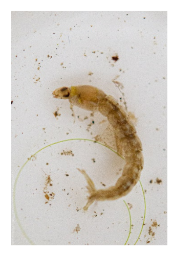
20 Midge larva, Chironomidae family (Insect)