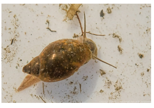
22 Bladder snails, Physidae family (Mollusc)