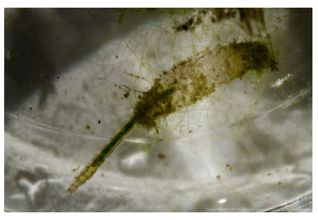
16 1 Midge larva, Chironomidae family (Insect)