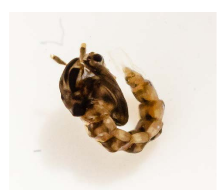
18 Mosquito pupa (insect)