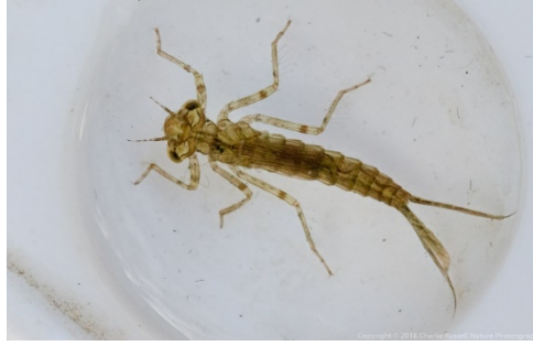
8 Damselfly Nymph, possibly Familiar Bluet (Enallagma civile) (Insect)