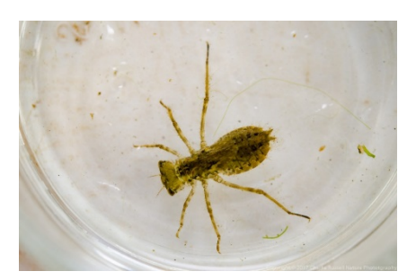
6 Dragonfly nymph - Skimmer (Libellulidae family) (Insect)