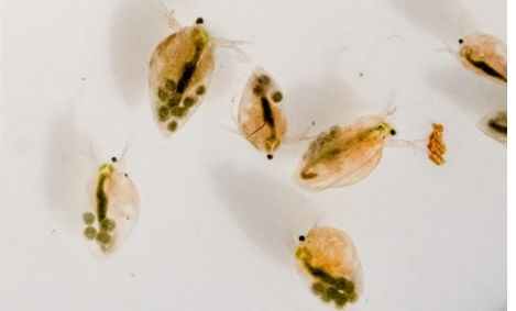
3 Water fleas, Family Daphniidae, Simocephalus sp. (Crustacean)