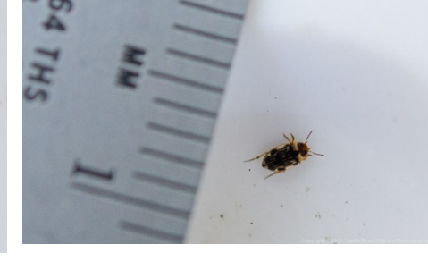
11 Predaceous diving beetle, either Liodessus or Neoclypeodytes (Insect)