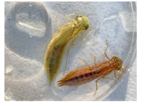
7 Dragonfly nymph, Common Green Darner, Anax junius (Aeshnidae family) (Insect)